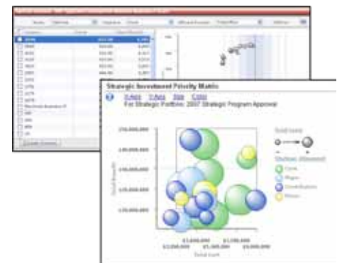
Strategic investment priority matrix and creation of project scenarios

With this Planview solution, development and product managers improve their ability to bring relevant products to market, and to accurately predict and hit revenue forecasts.