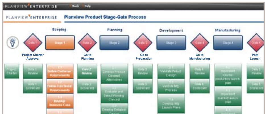
Automate your process – Stage-Gate, PACE, or custom – to speed time to market.

The Gate Manager Process Accelerator enables in-depth evaluation of individual projects, as well as the opportunity for your organization to continually improve processes by analyzing and reporting on key performance indicators for process compliance across the organization.